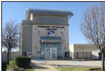
North TX $10,250,000 2 Properties