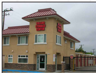
Fairfield, CA $7,700,000