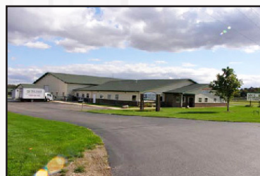
Mason, MI $2,200,000