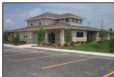
Bentonville, AR $2,460,000