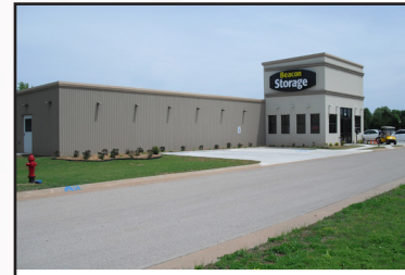
Oklahoma City, OK $15,100,000 3 Properties