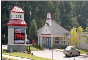
Babcock & Brown $44,300,000 11 Properties