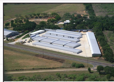
Fredericksburg, TX $5,100,000