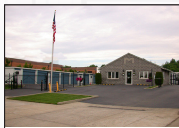
Staten Island, NY $4,600,000