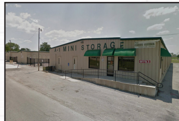
Ardmore & OKC, OK $12,974,800 4 Properties