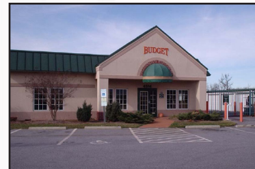
North Carolina $25,000,000 4 Properties