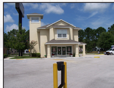
Jacksonville, FL $2,725,000