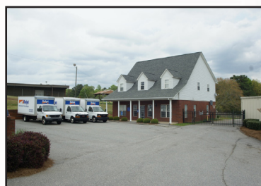
Oakwood, GA $1,112,500