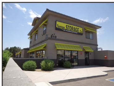
Tempe, AZ $4,300,000

Each year, Argus Broker Affiliates assist an average of 100 self-storage owners with the sale of their property. Our experience and reach extends to second and third-tier markets as well as the major MSAs throughout the U.S. Our unique combination of local expertise and national marketing exposure ensures that listed properties receive maximum exposure to the marketplace. Our extensive contacts with local, regional and national buyers give our clients unique access to the largest possible market of investors.