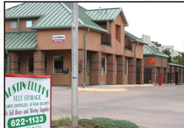
Colorado $15,250,000 3 Properties